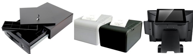
Cash Drawers Printers Rear LCD