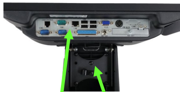
Ports and Cable Management